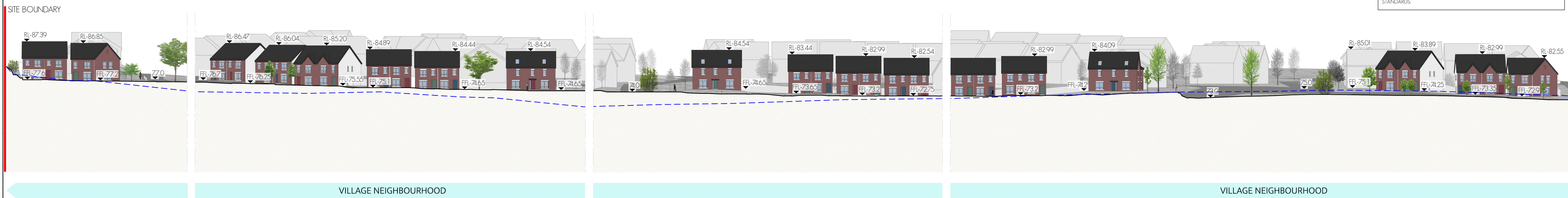
SITE SECTION F-F 1:500

THIS DRAWING IS FOR INFORMATIONAL & DISCUSSION PURPOSES ONLY. FURTHER DRAWINGS AND STUDIES WILL BE REQUIRED FOR CONSTRUCTION AND TO ENSURE COMPLIANCE WITH RELEVANT BUILDING REGULATIONS AND STANDARDS.