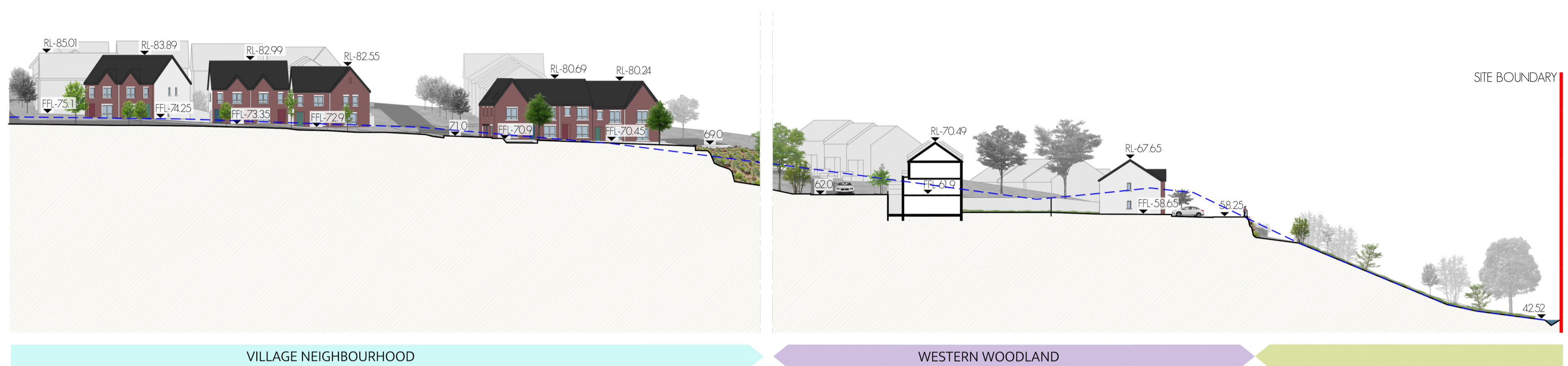
SITE SECTION F-F CONT. 1:500